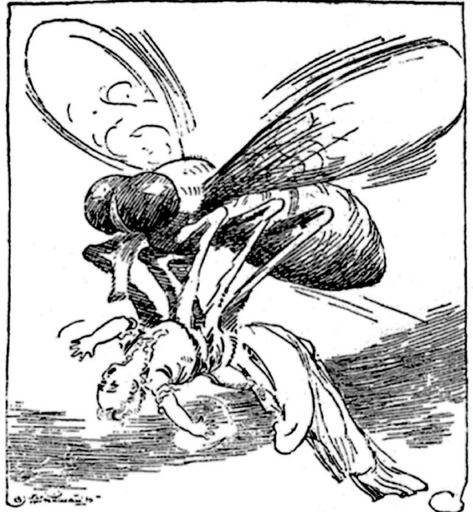
(From the Birmingham Age-Herald.) KEEP HIM FROM YOUR CHILD.

moldy flour, contaminated milk bottles or even bananas infected by tarantula spiders. Others advised parents to avoid children, believing the disease to be transmitted through sneezing, coughing, spitting and kissing.