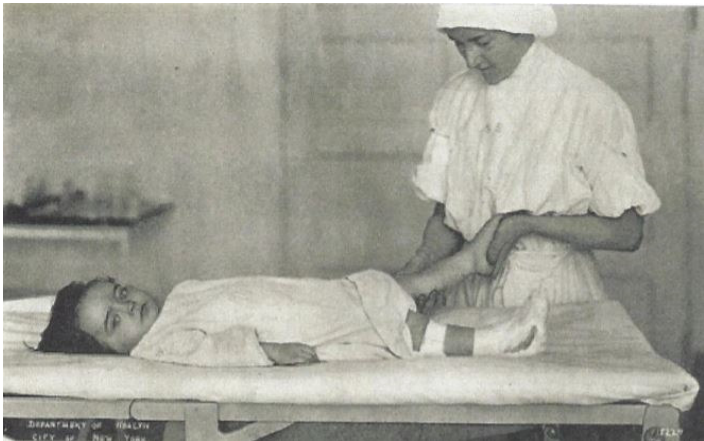
Exercising a paralyzed leg