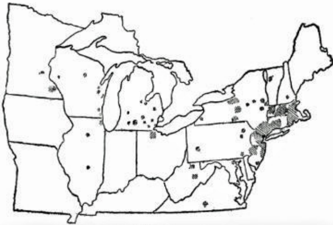
Shaded areas show localities particularly involved with the infantile paralysis epidemic of 1916 from Public Health Reports, November 24, 1916

The 1916 epidemic was the most devastating epidemic in the history of infantile/poliomyelitis. New York and New Jersey were the first to experience outbreaks. It was typical for outbreaks of the infection to surface during the summer months. Across the United States in 1916, infantile paralysis outbreaks took the lives of about 6,000 people, leaving thousands more paralyzed. Trenton, in proportion to its population, would eventually become the most seriously affected city in the United States.