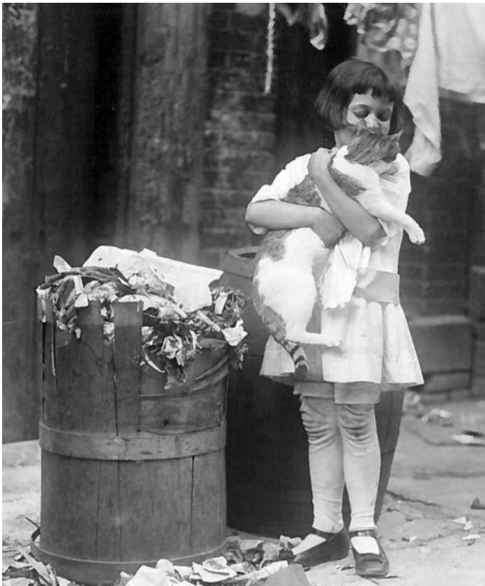
Illustrating how diseases like infantile paralysis spread: a girl hugs a stray cat that she picked up while feeding on garbage. (from Disease by Mary Dobson)

We now know that infantile paralysis was spread primarily through contaminated water, food or unwashed hands.