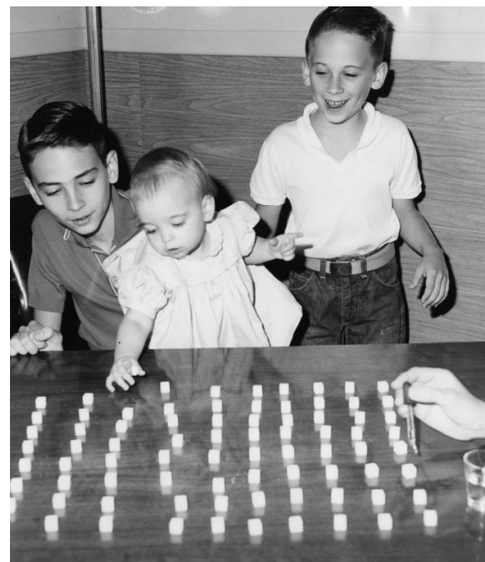
Sabin oral vaccine on a sugar cube

Two rivals in developing a vaccine for polio were Jonas Salk and Albert Bruce Sabin. The Salk killed vaccine (produced by killing the virus completely) was given by injection and is the approved vaccine in the US because of its greater safety. The Sabin oral, attenuated (live version of the virus with reduced virulence) vaccine is given in many parts of the world because of its ease in administration. Thanks to a successful vaccination program, the US has been polio free since 1979.