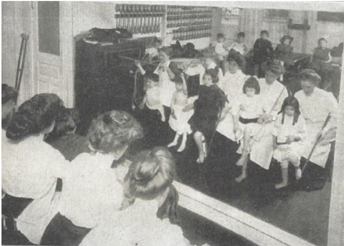
Therapeutic exercise before a mirror