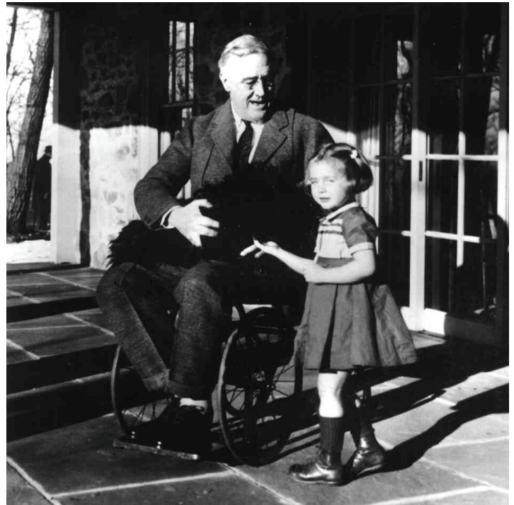
President Franklin Delano Roosevelt

President Franklin Delano Roosevelt was perhaps the most famous victim of what historians think was polio. He was stricken with an illness in 1921 that left his legs paralyzed for life. He avoided being photographed in his wheelchair, and he used braces and canes to appear to walk.