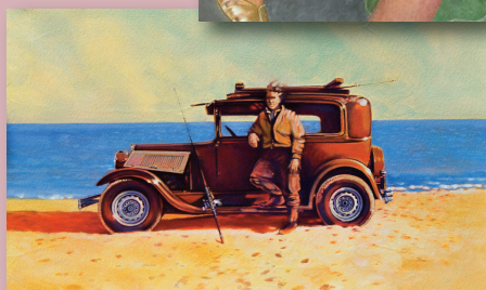
Dick's Beach by Thom Montanari