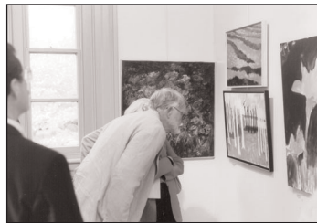
Patrons studying works at the Ellarslie Open