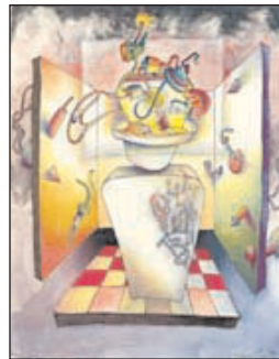
"Of Self" by Ed Beckett

The artists' websites provide insight into their work, as follows: