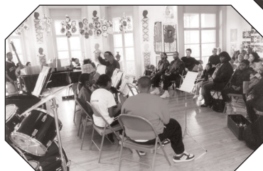
The Martin Luther King Jr. Band & String Orchestra