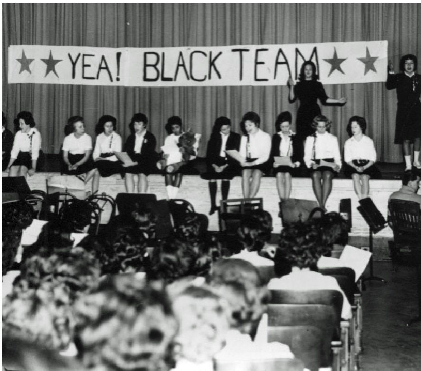
1962 Sport Nite