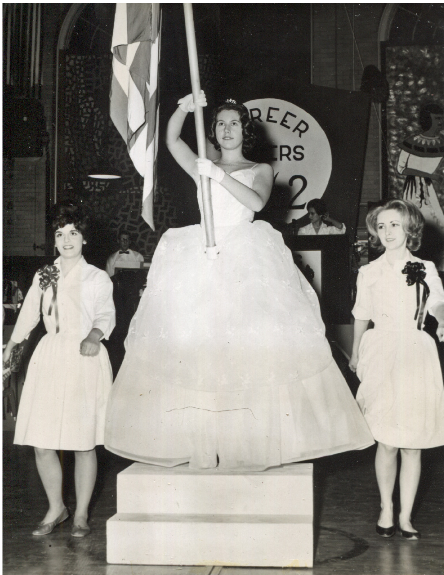
1962 Sport Nite