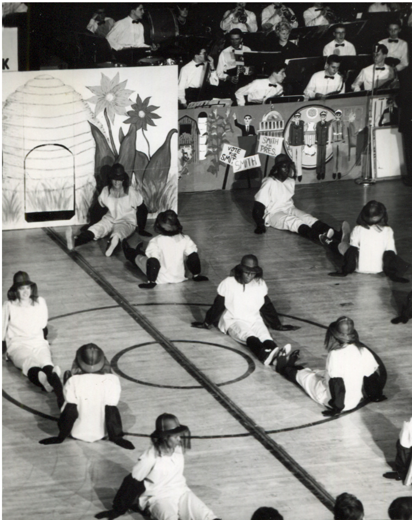
1962 Sport Nite BIBlack Team Modern Exercise – Honey Makes Money