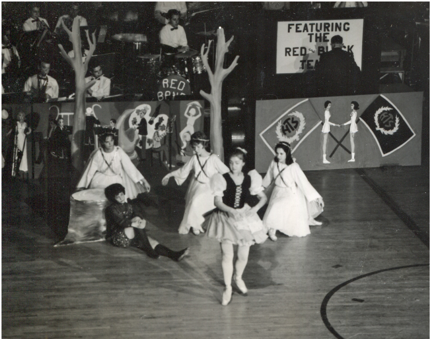
1962 Sport Nite Ballet – Non-competitive