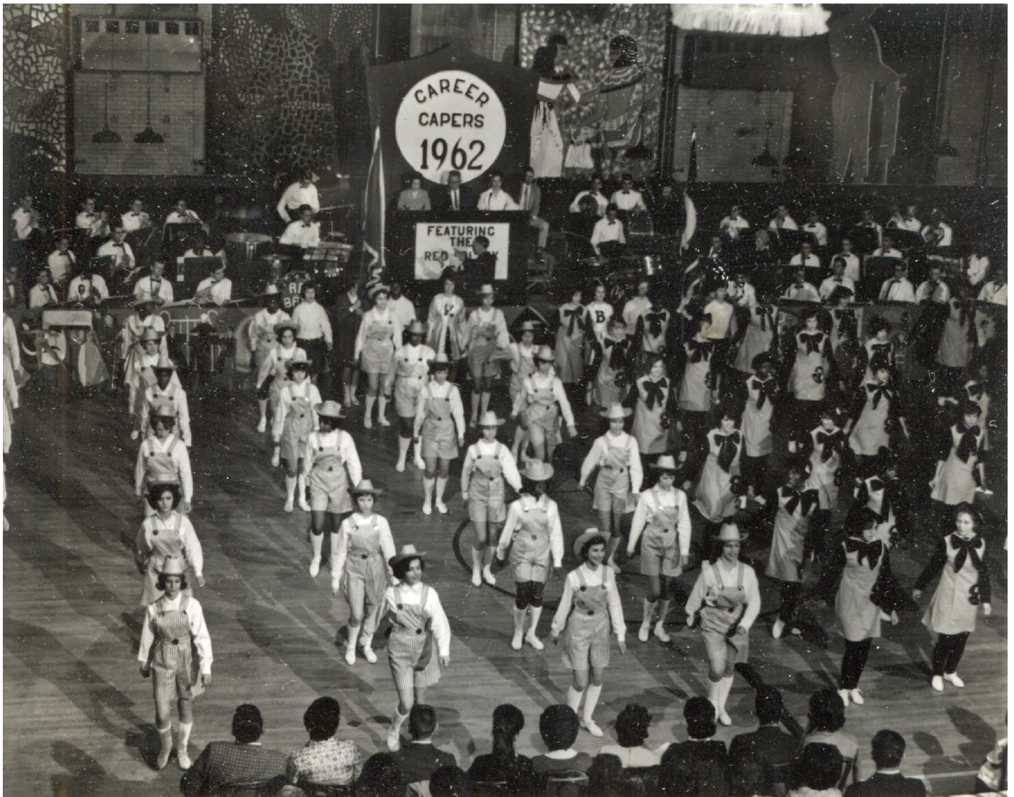
1962 Sport Nite

Red Team Marching-Farmettes – Black Team Marching-Artists on Parade