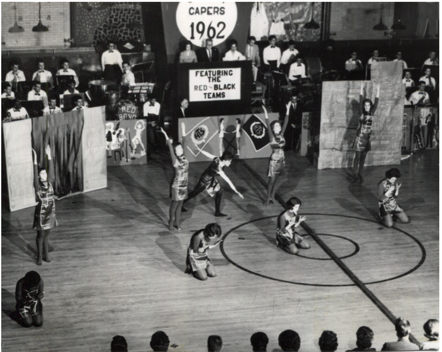
1962 Sport Nite