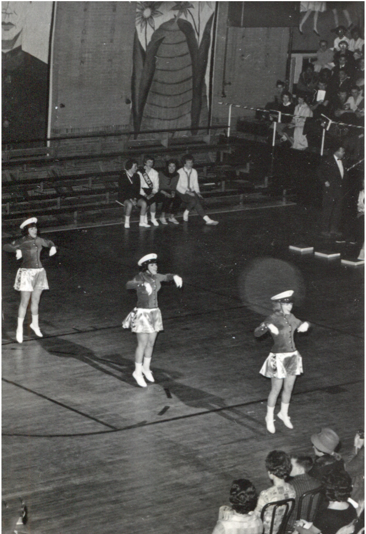
1962 Sport Nite Black Team Cheers