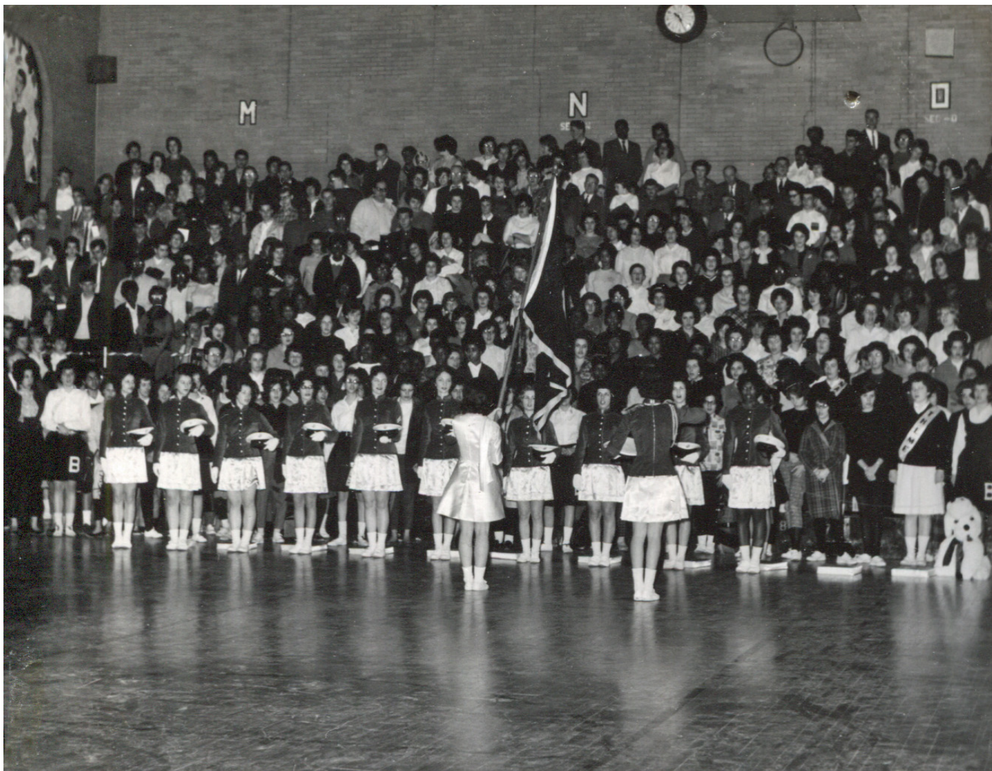
1962 Sport Nite

Black Team Cheers – Be Right-Be Ready-Be A Marine