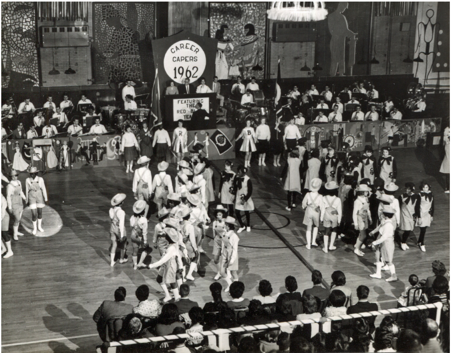
1962 Sport Nite