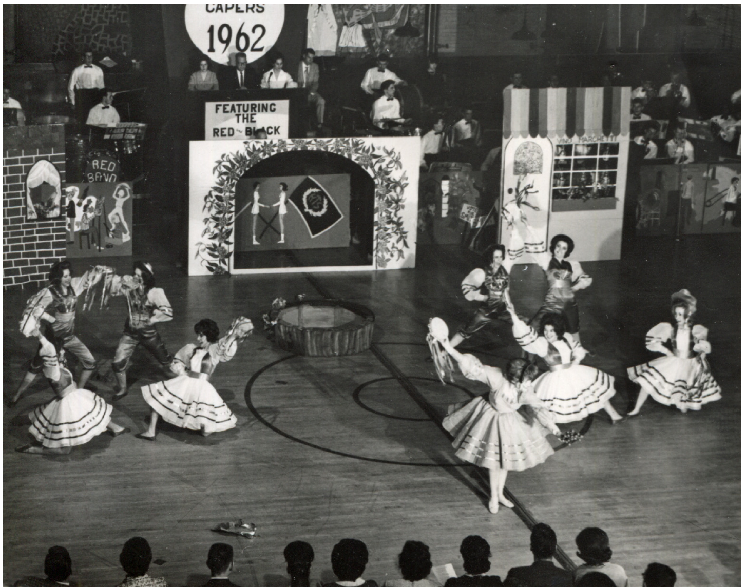
1962 Sport Nite Black Folk-Bona Fortuna