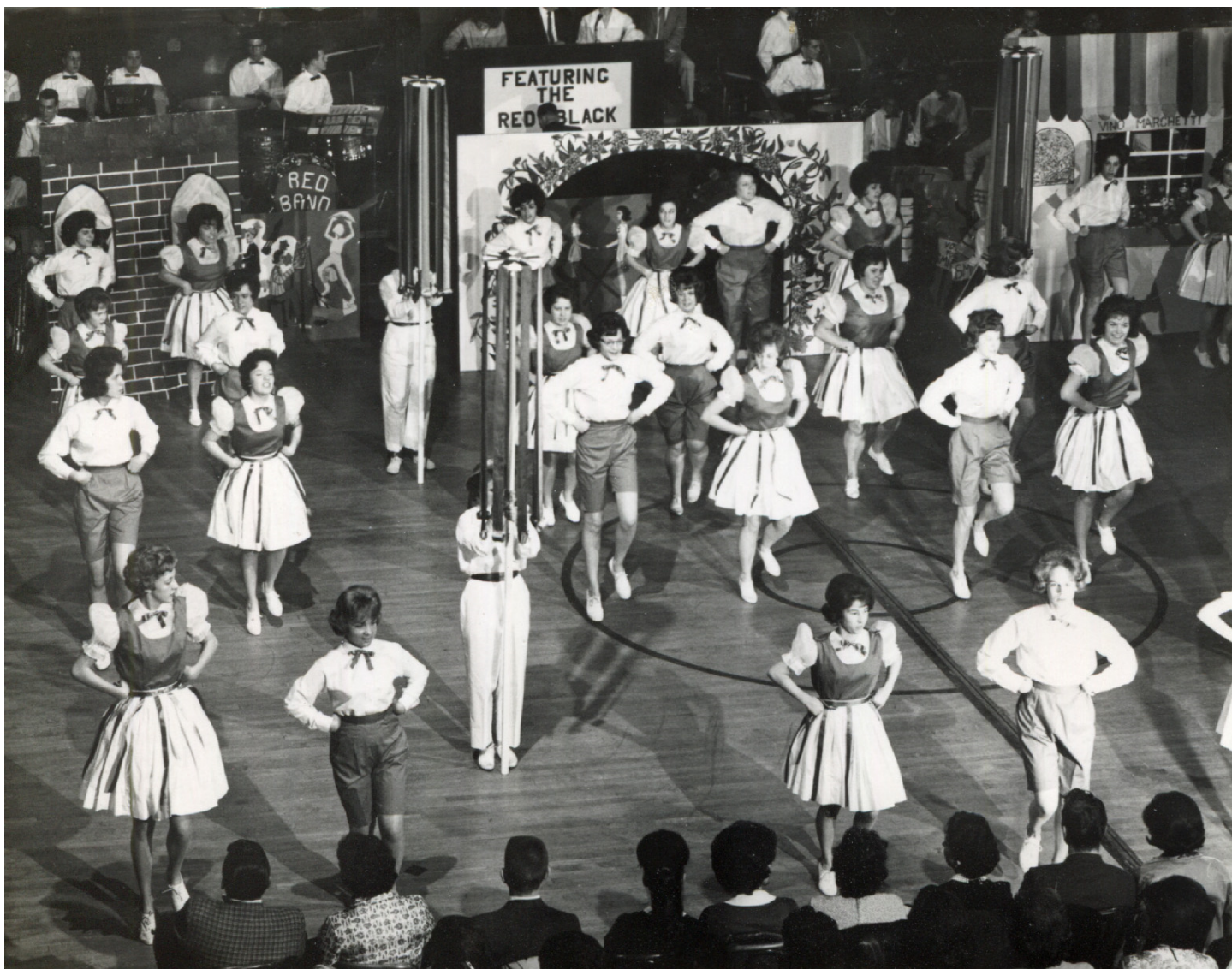
1962 Sport Nite