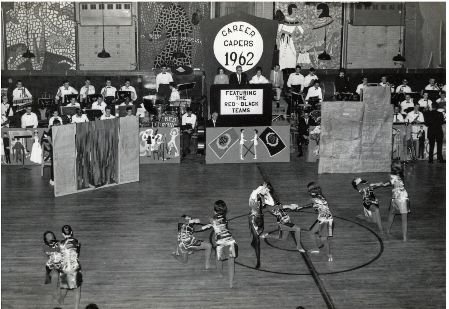
1962 Sport Nite