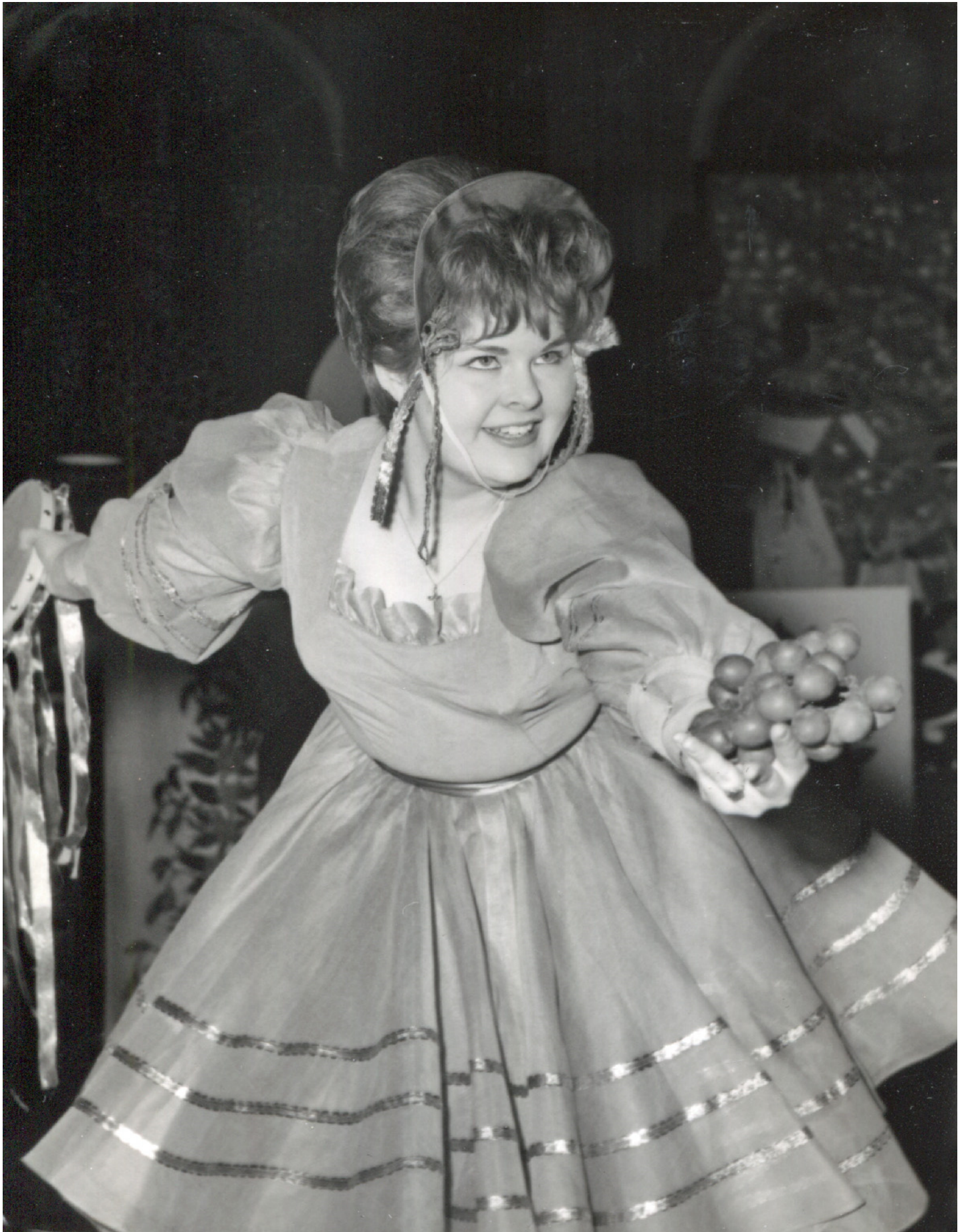
1962 Sport Nite