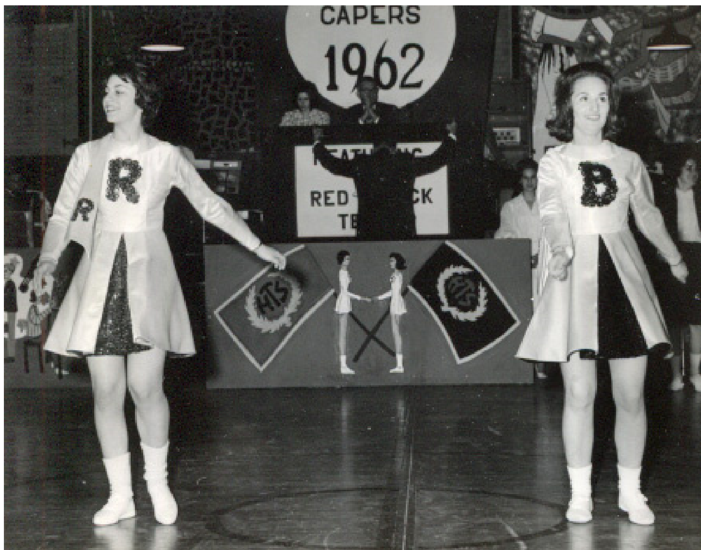
1962 Sport Nite