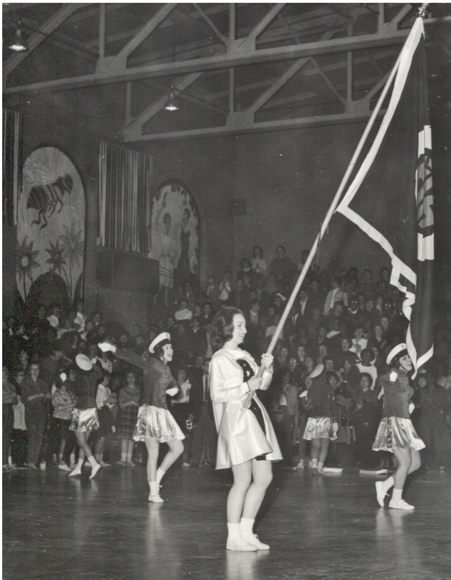
1962 Sport Nite