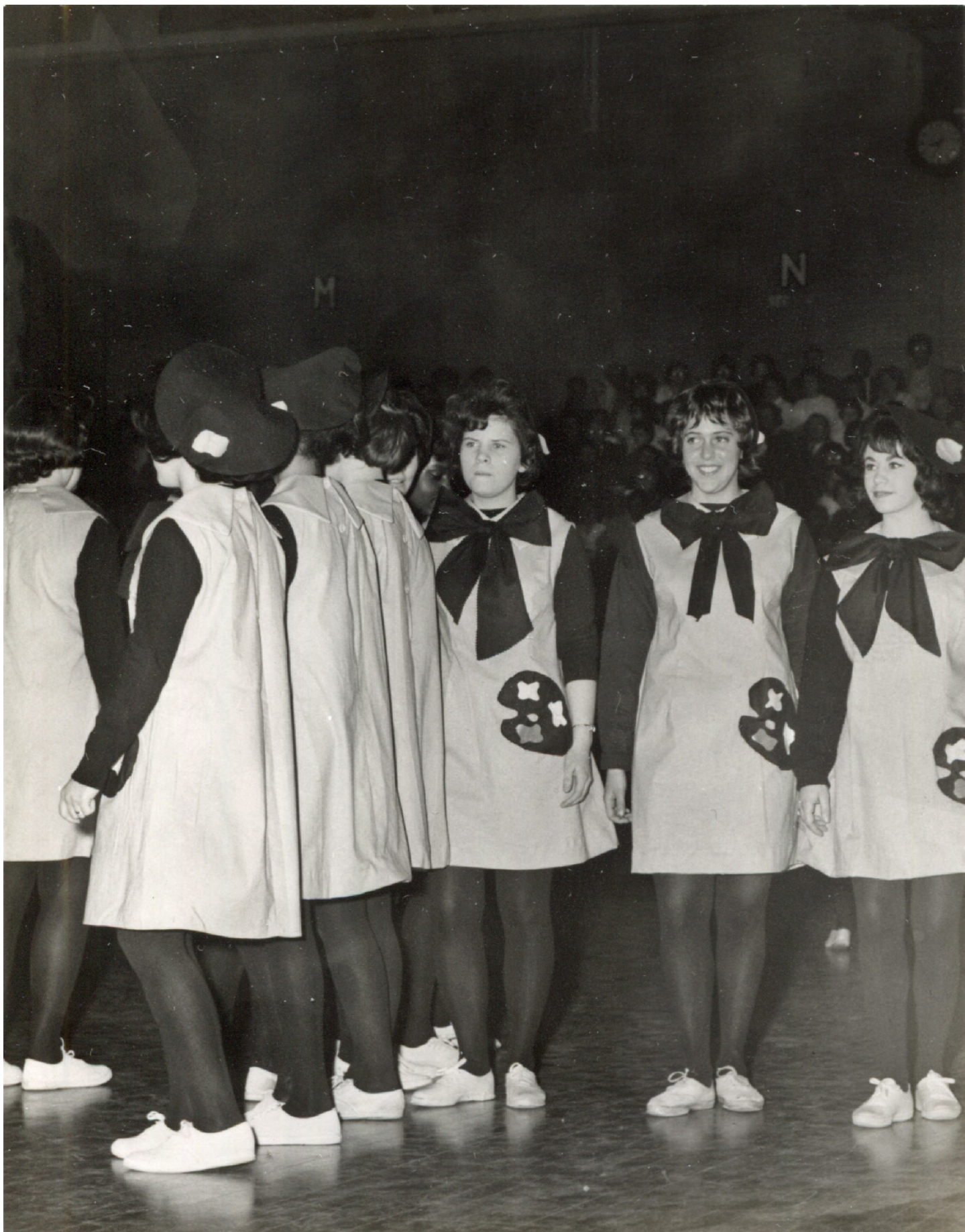
1962 Sport Nite