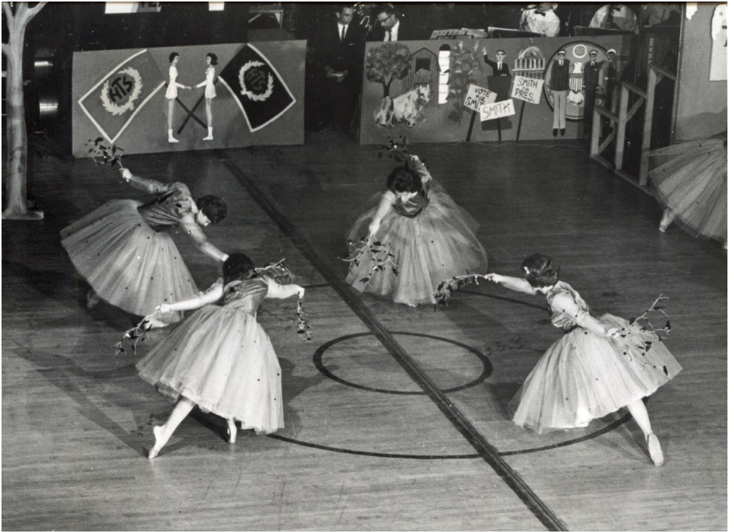
1962 Sport Nite