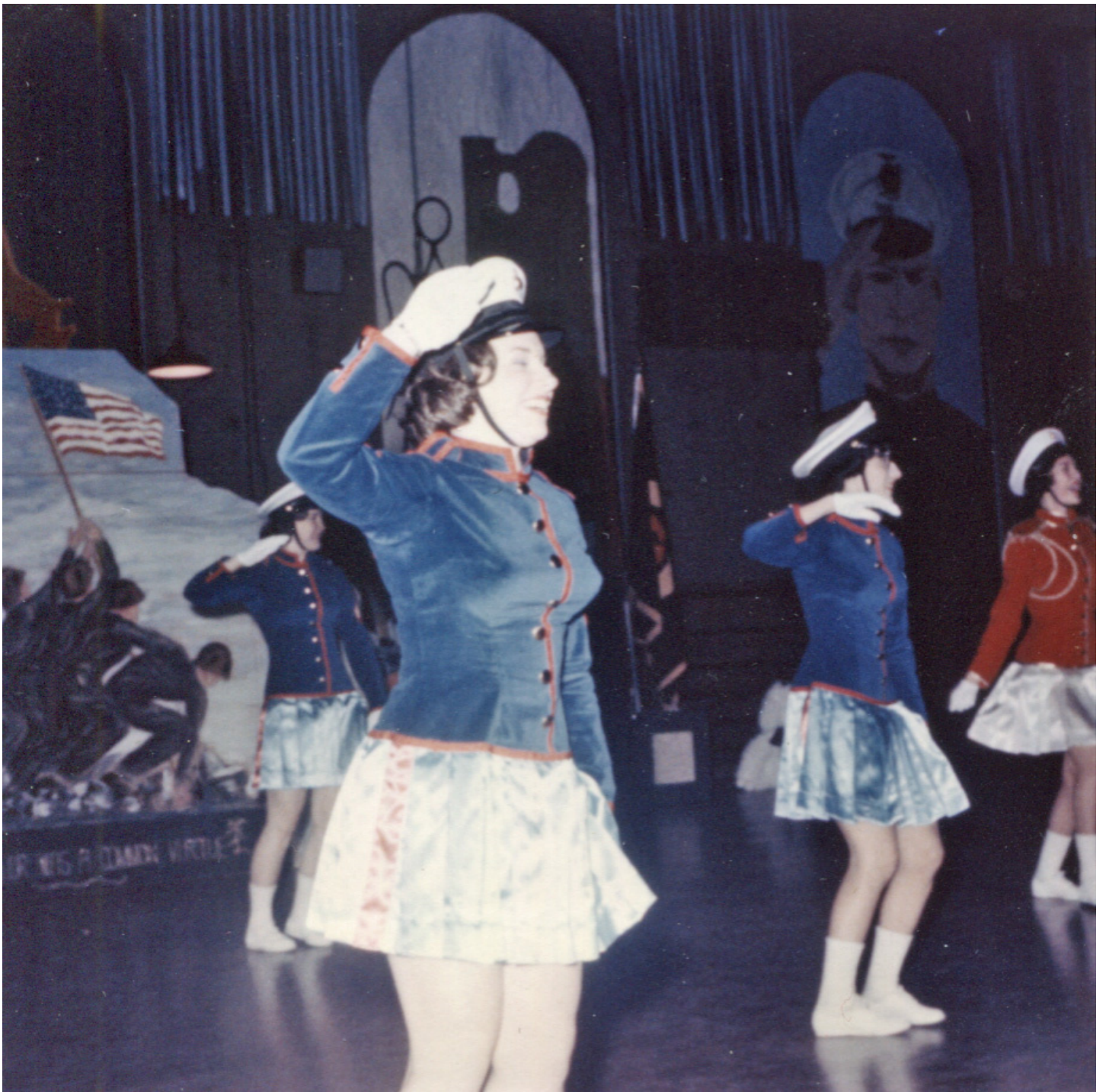
1962 Sport Nite Black Team Cheers