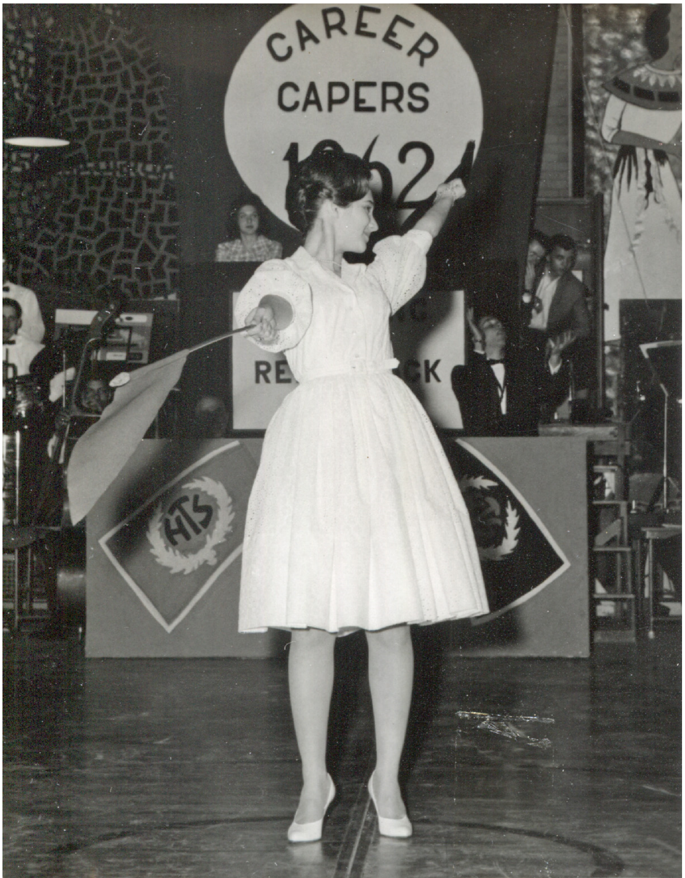
1962 Sport Nite