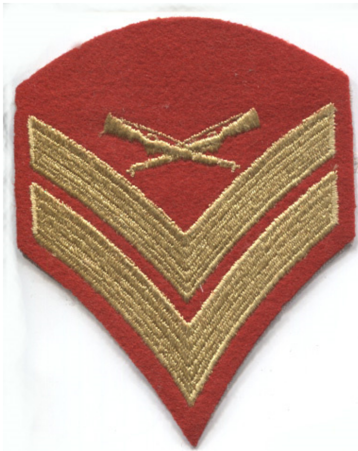
1962 Sport Nite