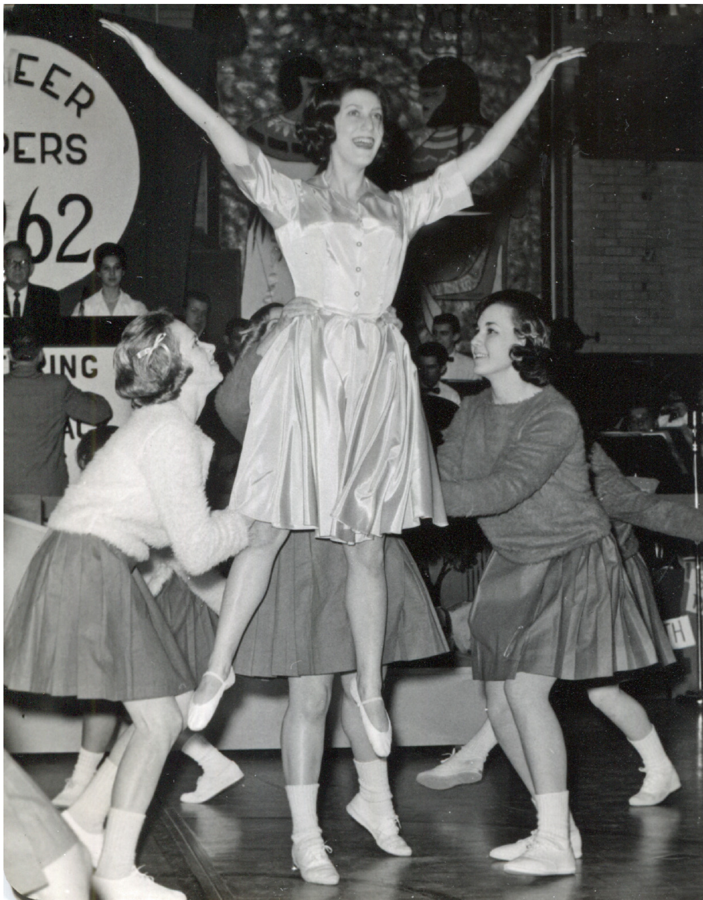
1962 Sport Nite