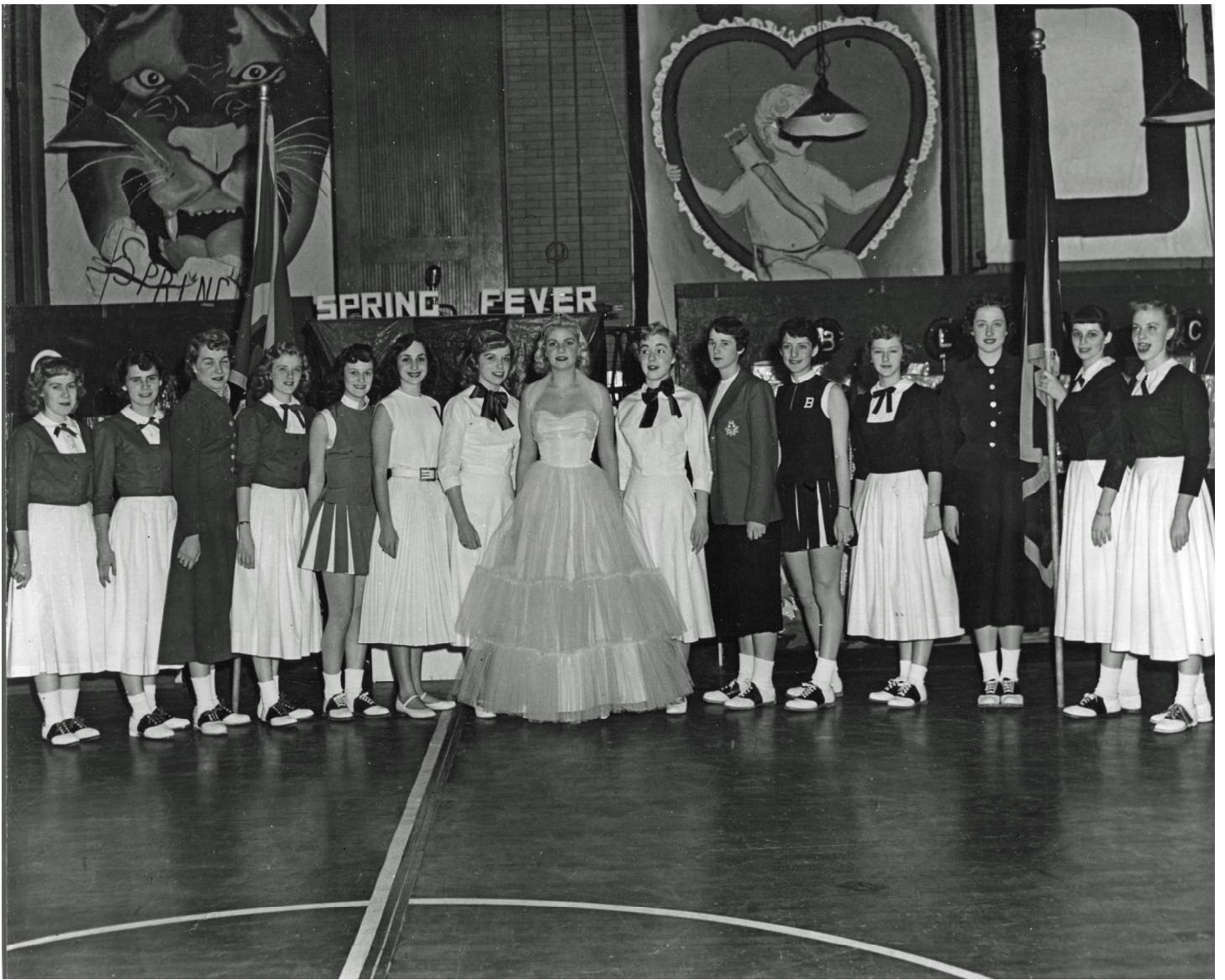
1953 Sport Nite