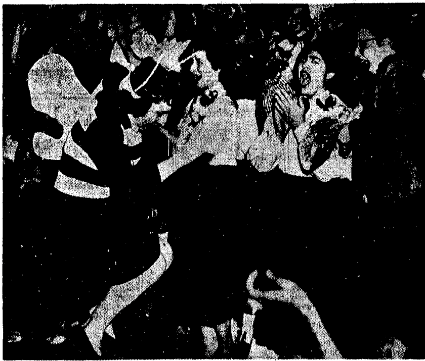
Bedlam rocked the Black Team bleachers after modern exercises and a Black Team band

scored tying points in the finale of the annual Girls Sports Night at Trenton Central High