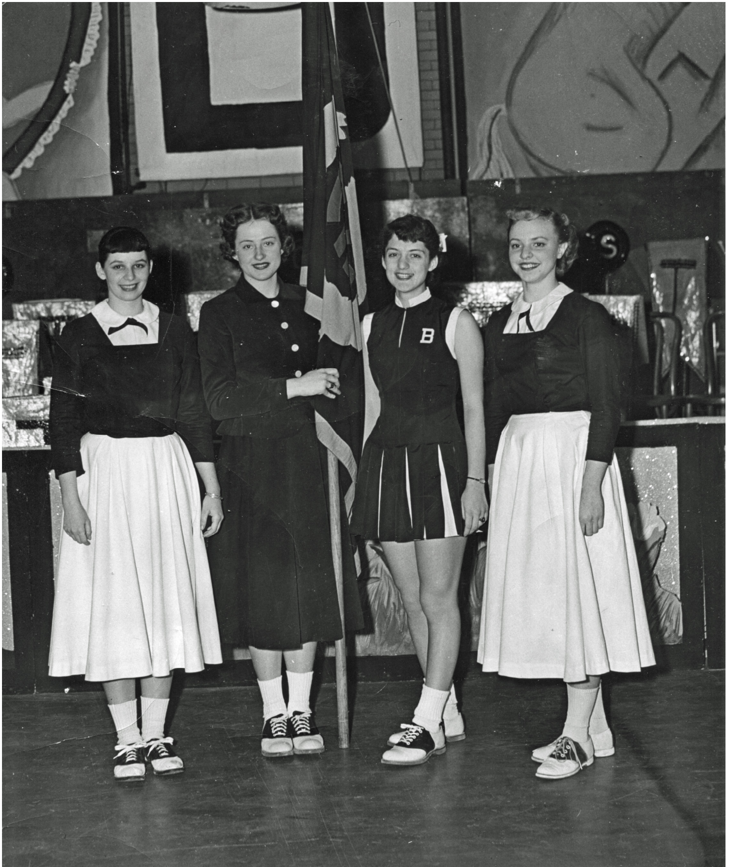
1953 Sport Nite