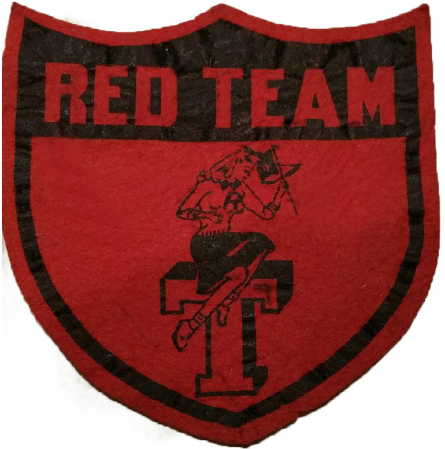
Red Team Shield from Chuck Farina