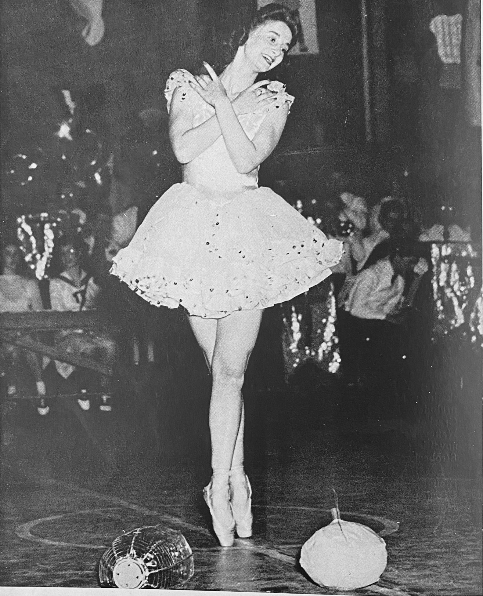
A Ballet Dancer As Cinderella At Sports Nite