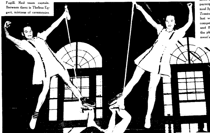
Apparently performing with the greatest of ease, these girls on the trapeze are Winifred Clugg, Inna South and Grace Pope.

On this page are pictured some of the 1,800 girls who participated in the fifth annual Sports Night program at Trenton Central High School last week. This gymnastic competition between Red and Black teams highlights the physical training department's activities for the year.