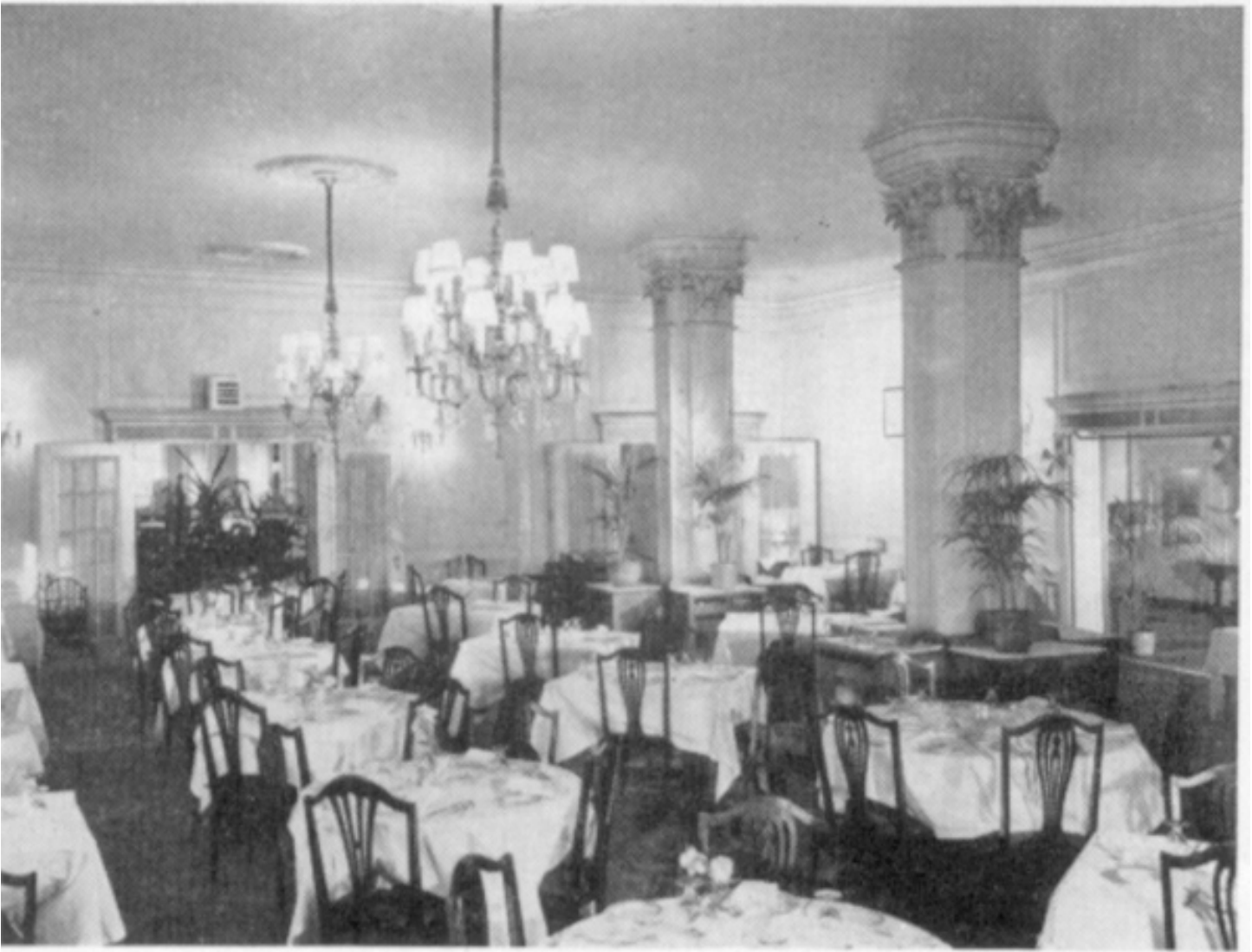
Air Conditioned Delaware Room

over each stove and gas range to draw up the hot air and cooking odors. This ventilating system is not by any means confined to the kitchen, but has been made one of the most important features of the entire building. For the preservation of meats and other foods, great refrigerators have been placed off the kitchen and on the basement floors. There is also a refrigerating plant where garbage is kept until removed from the building.