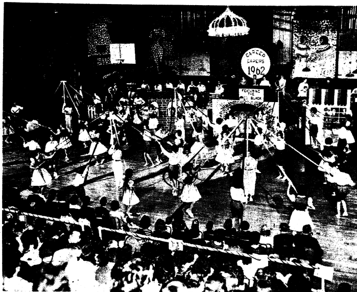
Black Team folk dancers are in the spotlight in this panoramic view of Trenton High School's 28th annual Sport Nite