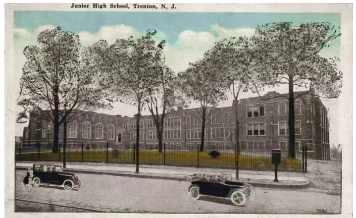
Junior No. 1, designed by Poland

In 1914 Poland designed the plans for Junior No. 1, one of the first junior high schools to be constructed in the east. The school was of Gothic design with an attached industrial looking structure at the back for the shops.