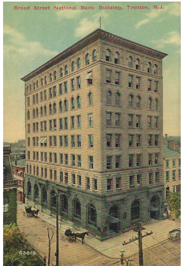
Broad Street Bank Building, 1899 designed by Poland

Among the banks: the Princeton Bank, the Bordentown Bank, and the Farmers National Bank, Allentown.