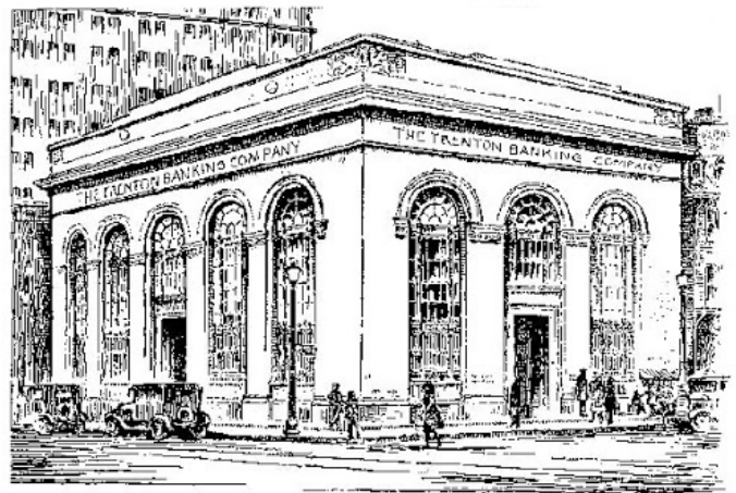
Trenton Banking Company replaced the Second Masonic Temple and stood on this site from 1919-1961

To finance the fine building, the Masonic Home Association was formed, with $75,000 in subscribers' monies held by Masonic members. Years later, the stock of the corporation began to get into the hands of people not connected with the Masons. As elder Masons died, this was likely to happen. The fact that the enterprise became a heavy burden to carry as time went on led to further outside sales and finally a majority of the stock was acquired by the Trenton Banking Company. In 1917, after about 33 years, the building was raised to make way for a new building for the Trenton Banking Company.