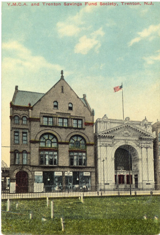
Trenton YMCA, 1892 designed by Poland