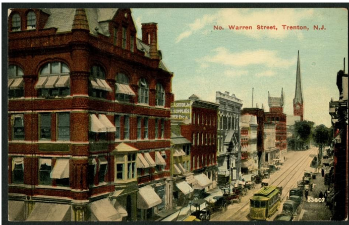
Second Masonic Temple (left hand corner), designed by Poland

The material used in the building was granite on the first story and Trenton pressed brick elsewhere. The sills, lintels, etc., were brown stone, and there were terra cotta ornamentals. The turrets on the roof were made out of terra cotta. Two fine broad entrances would lead to the upper stories. One would be at the State Street end of the structure and the other midway on Warren Street. The doors had iron grills. Over the Warren Street entrance at the second story there was a finely cut stone bay. A polished granite column support the turret at the corner.