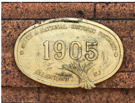
Farmers National Bank Building, Allentown designed by William A. Poland, 1905