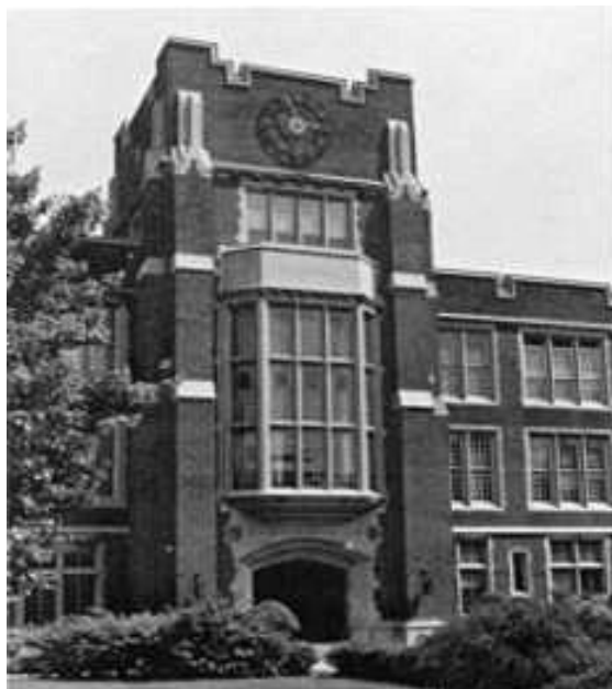
Junior No. 4, Poland was the Supervising Architect for its Construction

In 1926 Poland is the Supervising Architect for the construction of Junior No. 4.