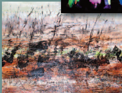
Stop Piping by Aurelie Sprout