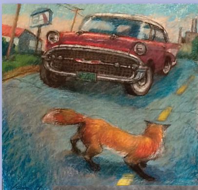
Decision Time for Red by Charles Viera